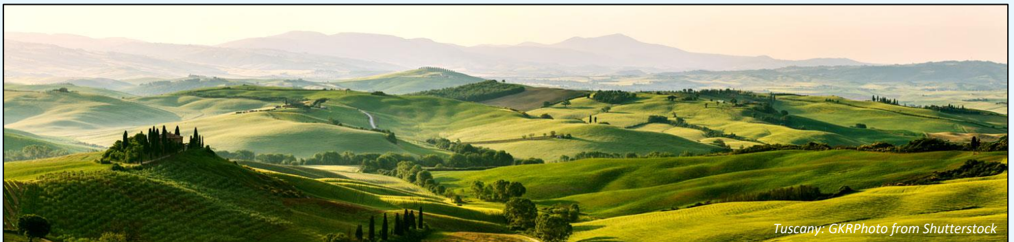
Tuscany: GKRPhoto from Shutterstock

Dear friends, we are never alone. Our spiritual paths may lead us through rolling hills, flowering meadows, waterfalls flowing from mountain peaks, and deep pools of healing waters. Sometimes, we may travel long stretches of flat barren earth or slowly climb steep hills. The diversity of our path is what makes it both interesting and challenging. We never know what opportunities lie ahead. What is consistent in our journey, is our spiritual family who pick us up when we fall, and continue to love us in spite of ourselves. Consistent is the presence of our angelic guides, who focus our vision on God's attributes of beauty, who influence our navigation to experience greater heights of happiness and soul expressions of Love, and who protect us from ourselves and others. Our Heavenly Father and our angelic guides are always with us, even during periods of "soul consolidation" when nothing seems to be happening in our spiritual progress but it is a time when our souls are being made stronger in the Love. So, remember that you are loved, you are beautiful, you are important to God and the Celestials, and you are never alone. In fact, you are a member of the Celestial Family. Contemplate that and let it sink in.